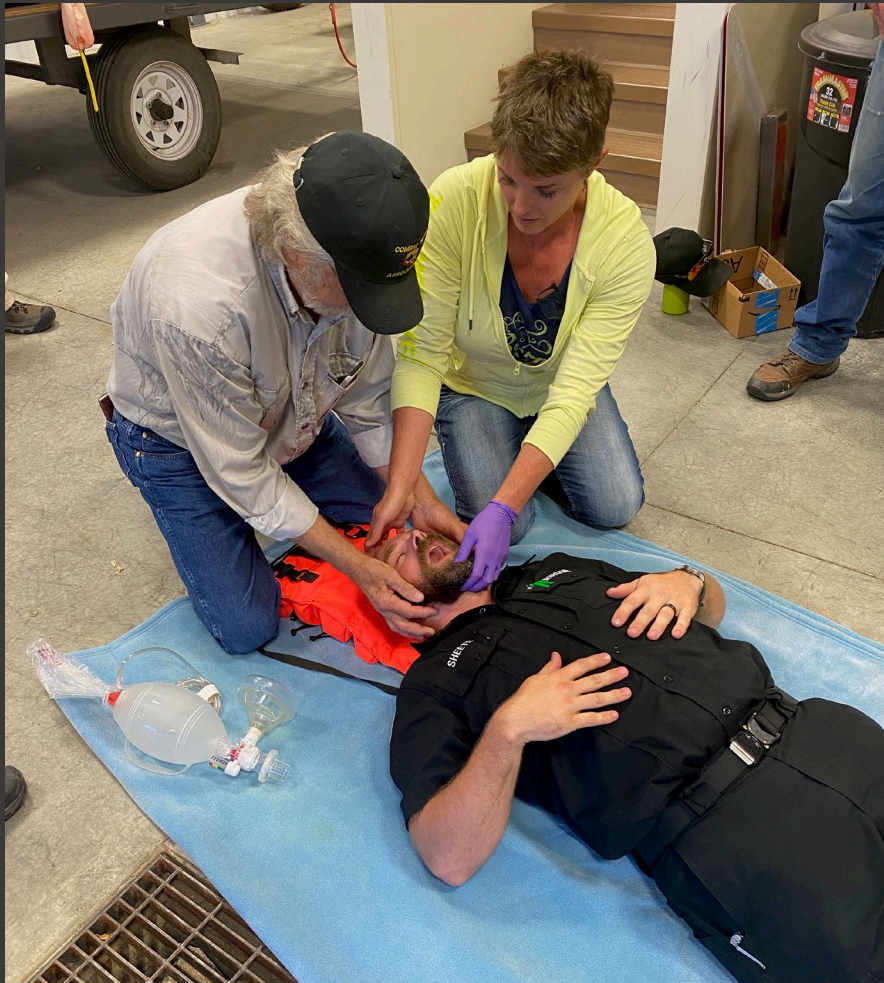
A SAR volunteer/physician demonstrates airway maneuvers on a wilderness paramedic