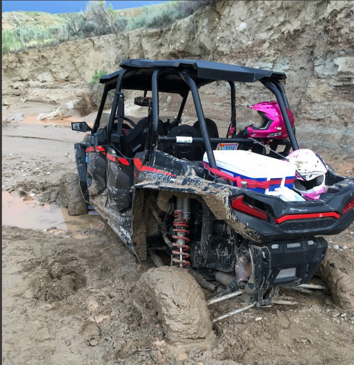
Teams respond when a tourist gets a utility vehicle stuck in a remote draw