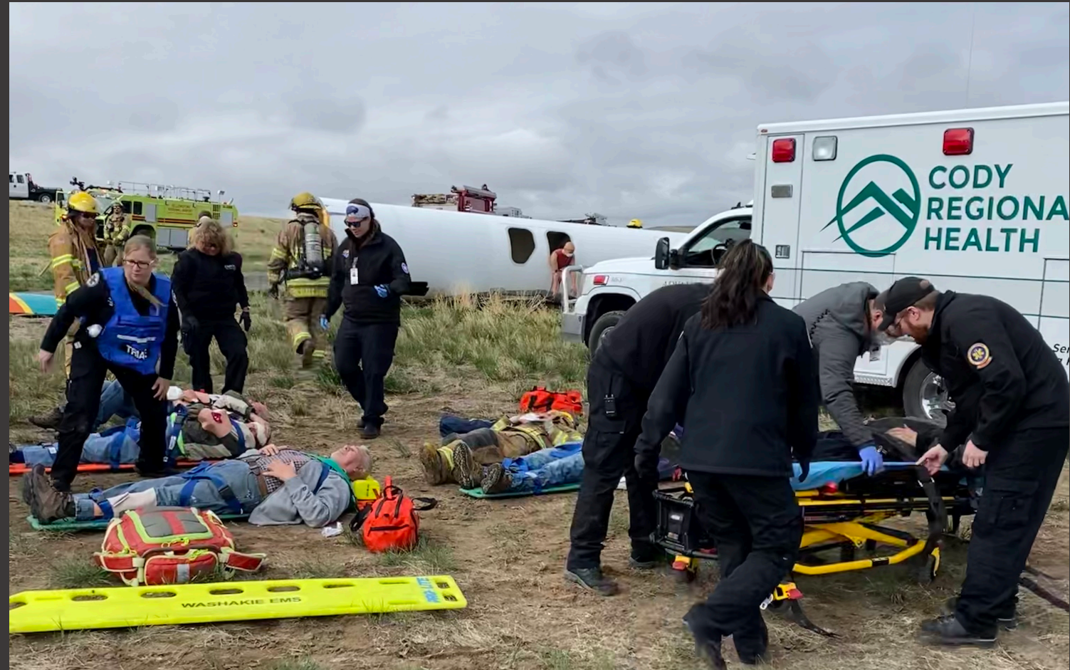
Firefighters, EMS and SAR members respond to a mock county disaster drill at the airport