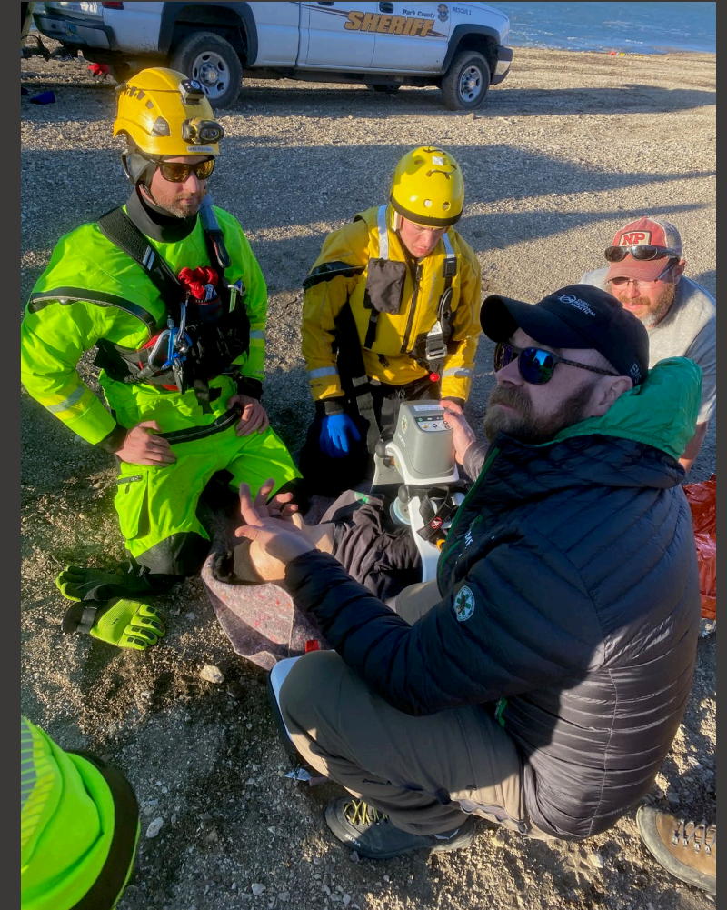
A paramedic teaches an ice rescue team how to use a Lucas device for CPR.