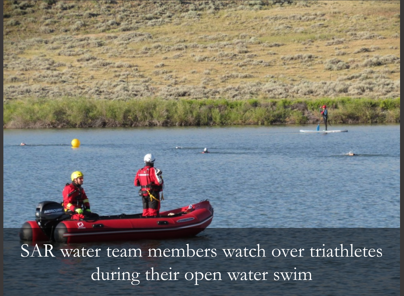
SAR water team members watch over triathletes during their open water swim