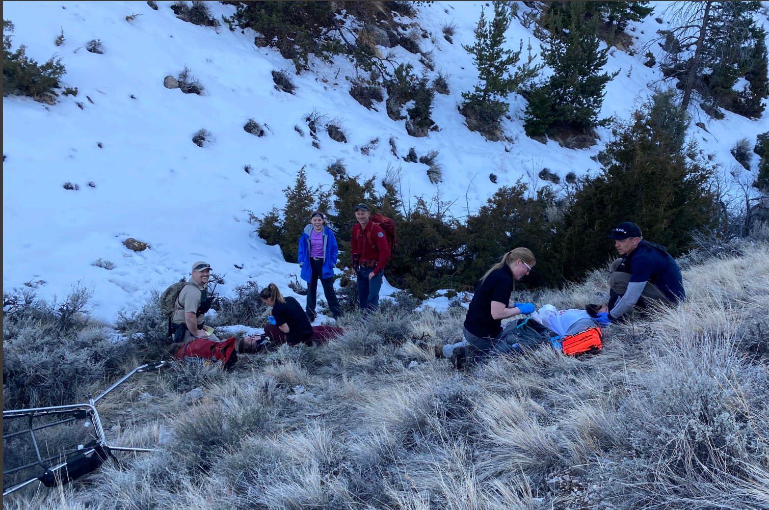
A Bureau of Land Management Ranger, Wilderness Paramedic and a Game and Fish Warden help Park and Bighorn Co SAR treat victims of a bear mauling