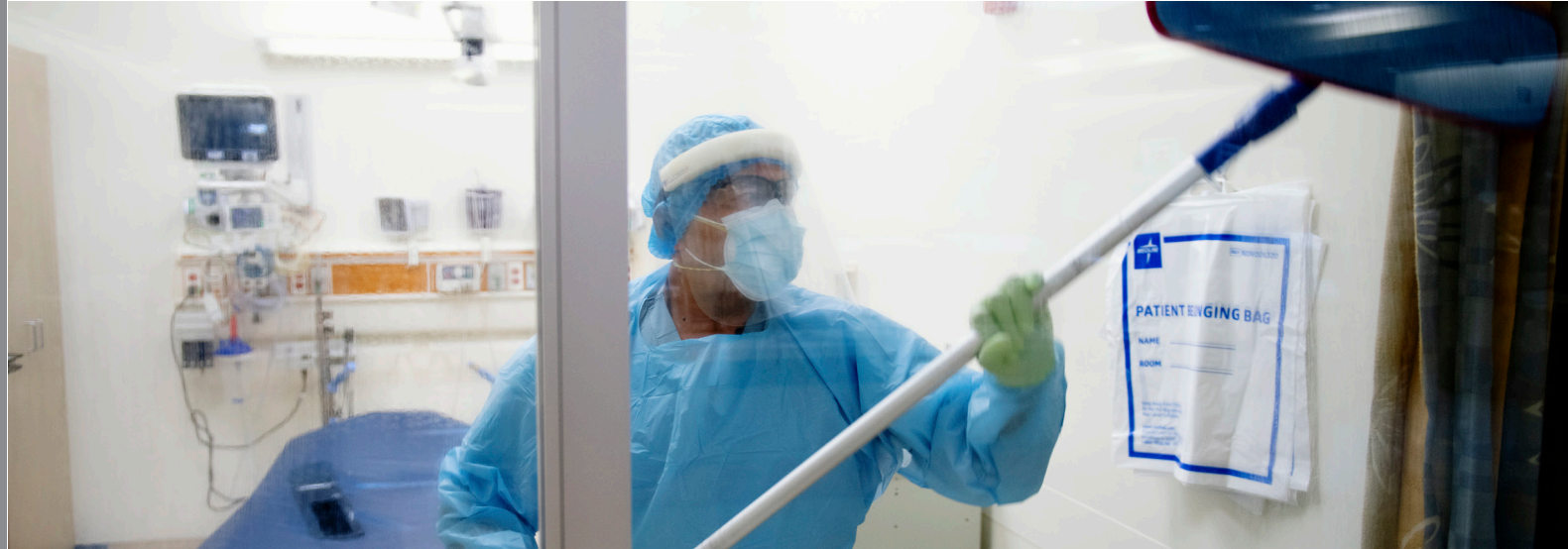
A NorthShore Environmental Services team member wipes down and disinfects the windows inside an Emergency Department patient room.