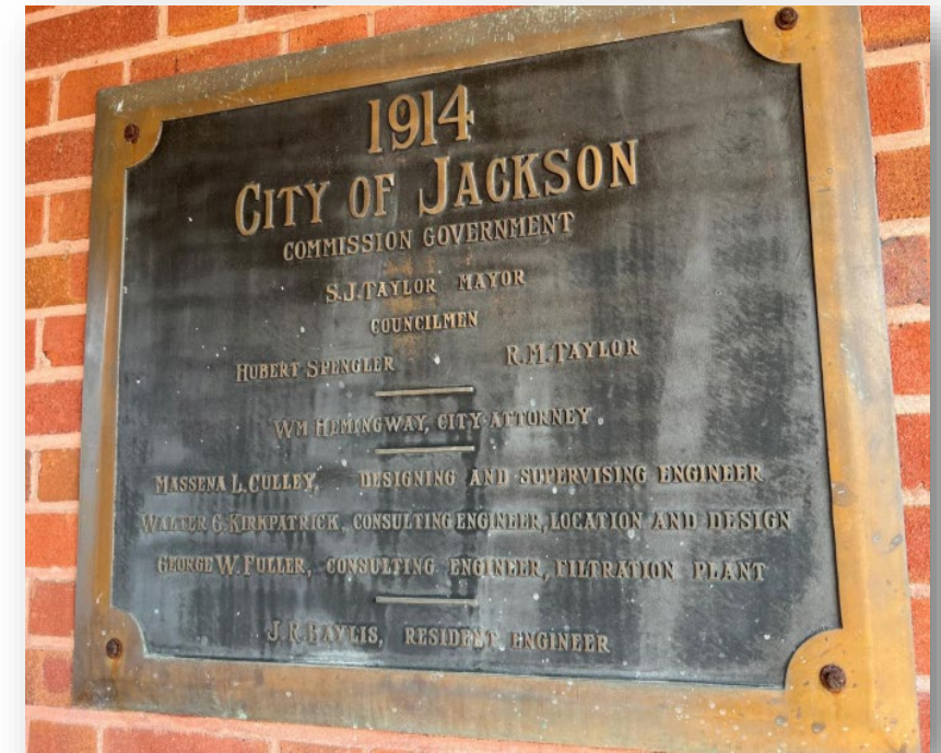
J.H. Fewell Water Treatment Plant