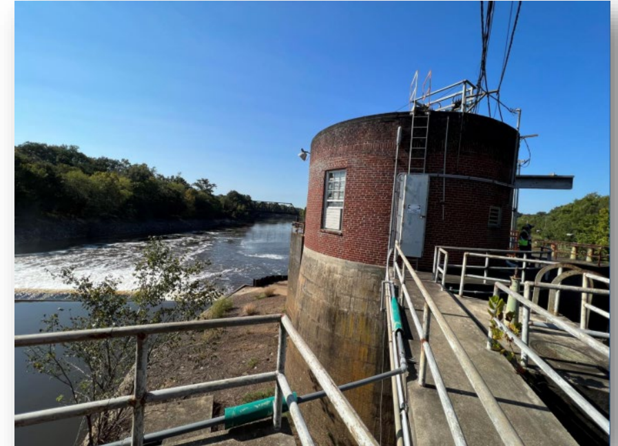
J.H. Fewell Intake from Pearl River